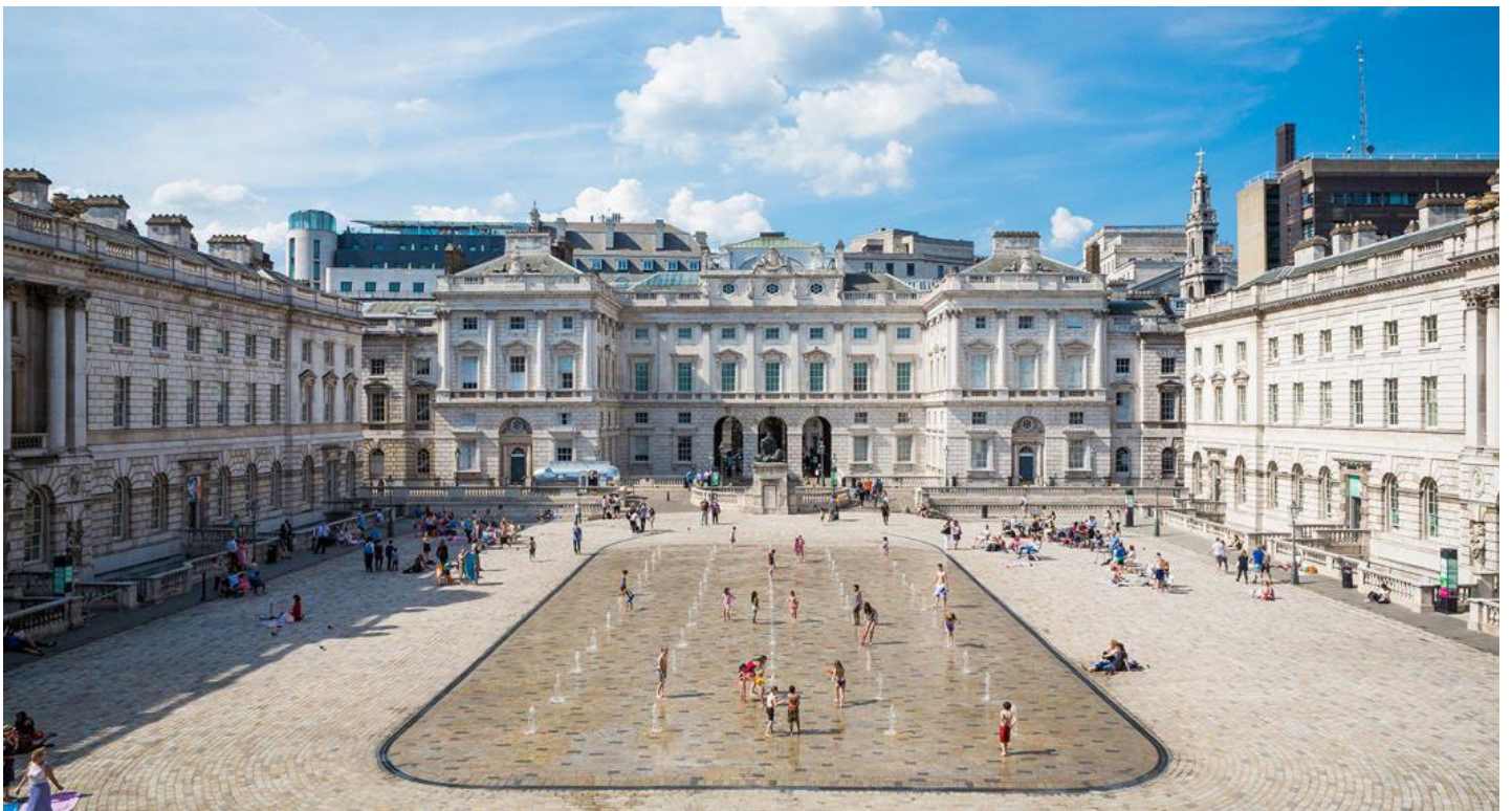
The Edmond J. Safra Fountain Court, Somerset House

How far are we willing to go to optimise the management of the whole earth? G80 speculates on a global management system for planetary issues by bringing together different types of intelligence around a control console in a contemporary reinterpretation of R. Buckminster Fuller's “World Game”. G80 is an interactive work by the Swiss collective Fragmentin, commissioned by mudac in anticipation of its next program that will start in September in Lausanne and will be entirely dedicated to examining the multifaceted and complex relations between the cosmos and planet Earth.