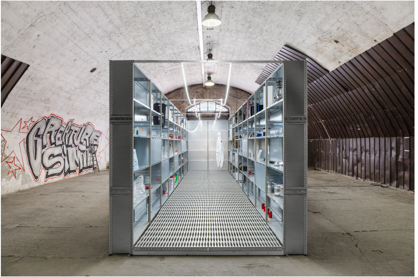
Prepper's Pantry: Objects that Save Lives , Dropcity, Milano, April 2023