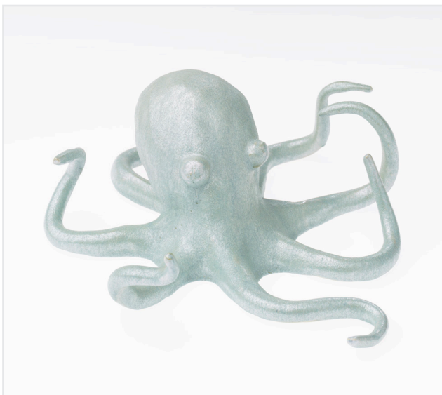
Mai-Thu Perret, Octopus , 2011