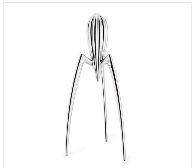
Philippe Starck, Juicy Salif, 1991