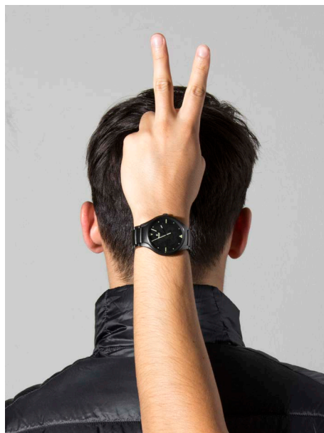
Big Game, TRUE PHOSPHO , Watch for Swiss brand RADO, 2017 © BIG-GAME