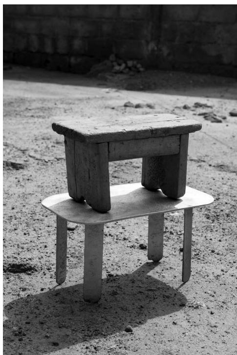
Hors Pistes, Tables and Stools, Ouagadougou project, 2014