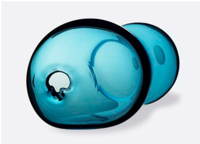
Rehberger Tobias, Autobdelygmisch, 2003

We're excited to meet visitors at the expo and put on this large-scale event in such an exceptional space.