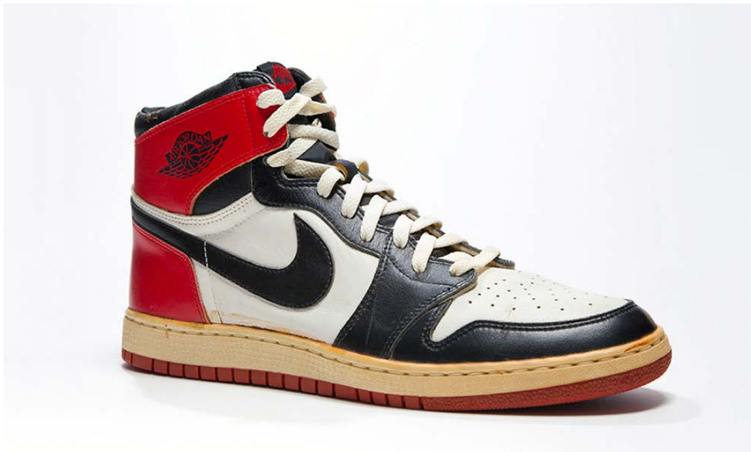
First Nike Air Jordan, 1984

Sneakers: cutlure x collab aims to showcase this positive power in a global and immersive way by evoking both the emergence of the phenomenon, starting with the Jordan 1 (1985), and recent exclusive projects. Sneakers: cutlure x collab aims to showcase how trainers – which represent a real culture and art of living – have triggered a shock wave that has reached fashion, music, photography and ultimately all layers of contemporary creation.