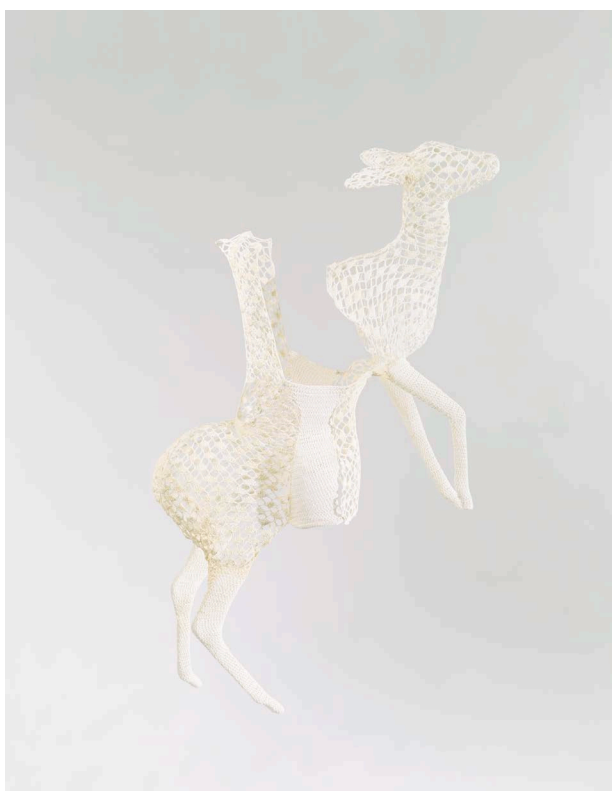
Julie Simon, Vêtement-objet , 2011 Design collection of mudac

In Extraordinary, we bring together loaned pieces and works from our collections to pay homage to Gaudard House, the museum's home since 2000. The exhibition recreates the original rooms of the house (living room, bathroom, lounge, kitchen, dining room, bedroom, etc.) but filled with extraordinary objects – extraordinary because of their materials, technique, aesthetic appeal or the ideas they inspire. This exhibition, the last before our move to the PLATEFORME 10 site, will also commemorate nearly 20 years of the mudac at Place de la Cathédrale.