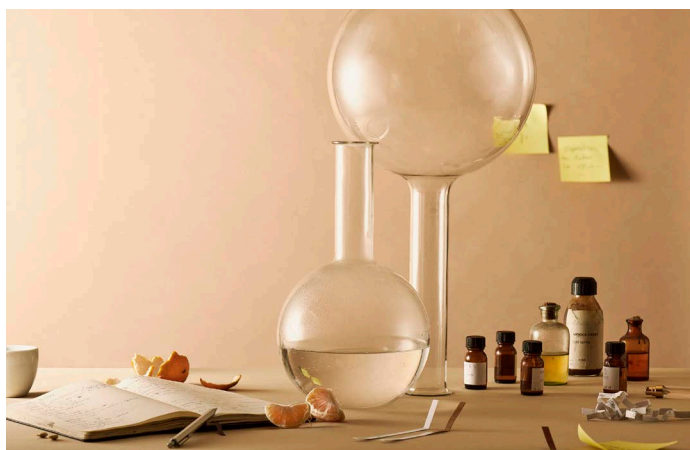
Roberto Greco, L' Hespéridée , Original work for the exhibition, 2018

The exhibition will present the world of thirteen perfumers. Perfumers' careers reflect the diversity of contemporary perfumery as men, women, newer and established perfumers, owners of their own label or brand associates, but also in-house composition perfumers, work for the perfumery domain. A close dialogue between curators and perfumers will help select the elements to represent each of the exhibition's creators in the best way. The perfumers' point of view, approach and references will be communicated to the public via interviews, while close work with the team of the review NEZ will guarantee in-depth knowledge of the field of perfumery.