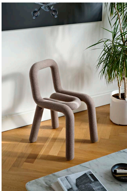
Big Game, BOLD, Upholstered chair for French company Moustache, 2009