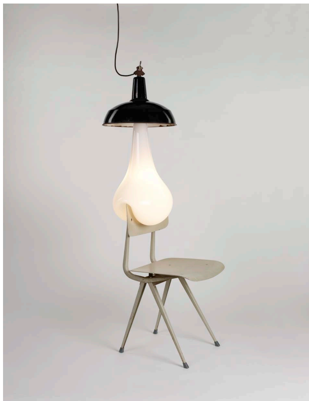
Pieke Bergmans, Light Blub , 2015 Contemporary glass art collection