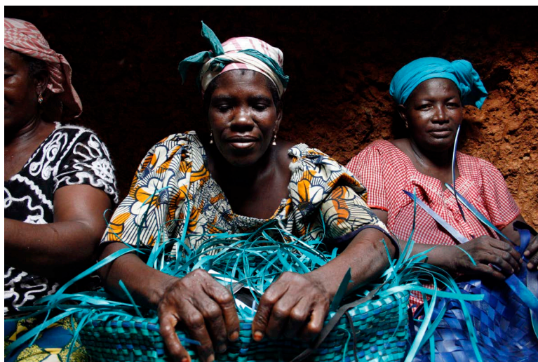
Hors Pistes, Weavers, Banfora project 2014