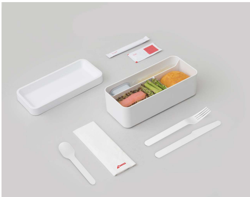
Big Game, SWISS BENTO BOX , la SWISS BENTO BOX , 2017

The EVERYDAY OBJECTS exhibition features a selection of simple, functional and optimistic objects that give the studio its distinctive identity, in a scenography that reproduces different living spaces.