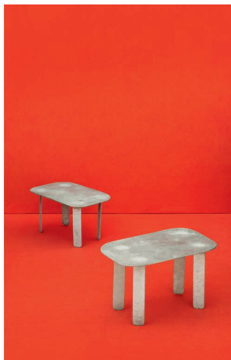
Hors Pistes, Tables and Stools, Ouagadougou project, 2014