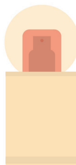
La fille de l'air by Courrèges Perfumer : Fabrice Pellegrin