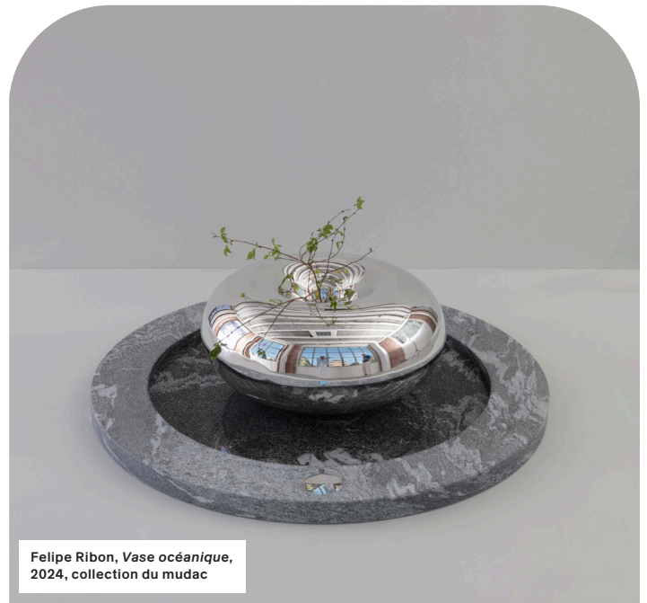
Felipe Ribon, Vase océanique , 2024, collection du mudac