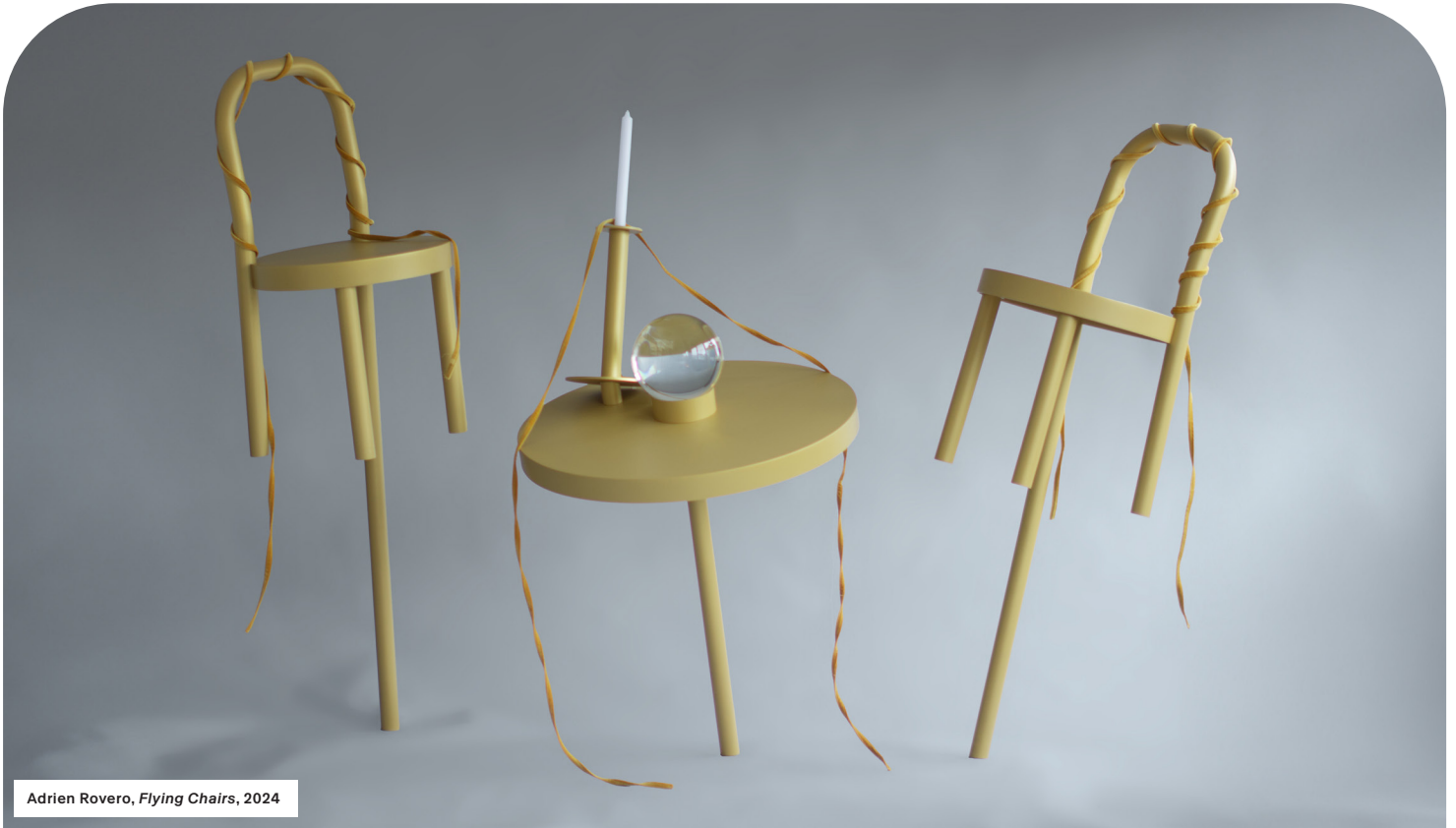
Adrien Rovero, Flying Chairs , 2024