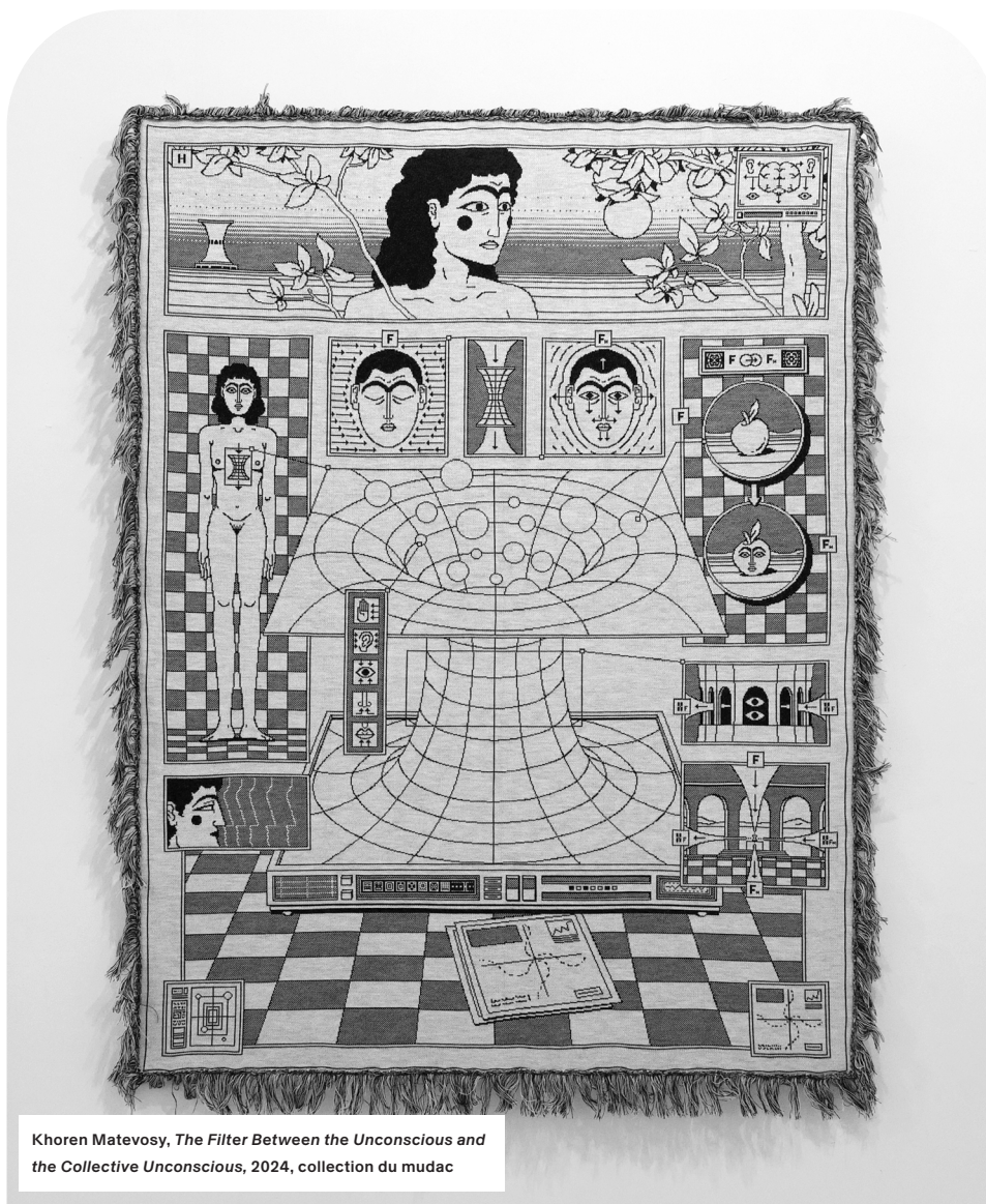
Khoren Matevosyan, The Filter Between the Unconscious and the Collective Unconscious , 2024, collection du mudac