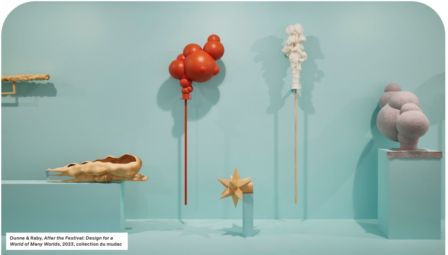
Dunne & Raby, After the Festival: Design for a World of Many Worlds , 2023, collection du mudac