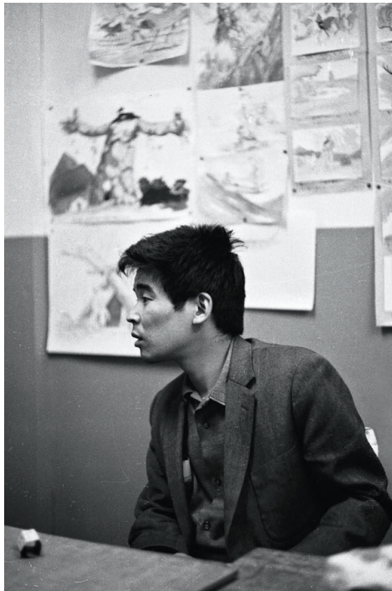
Portrait of Isao Takahata