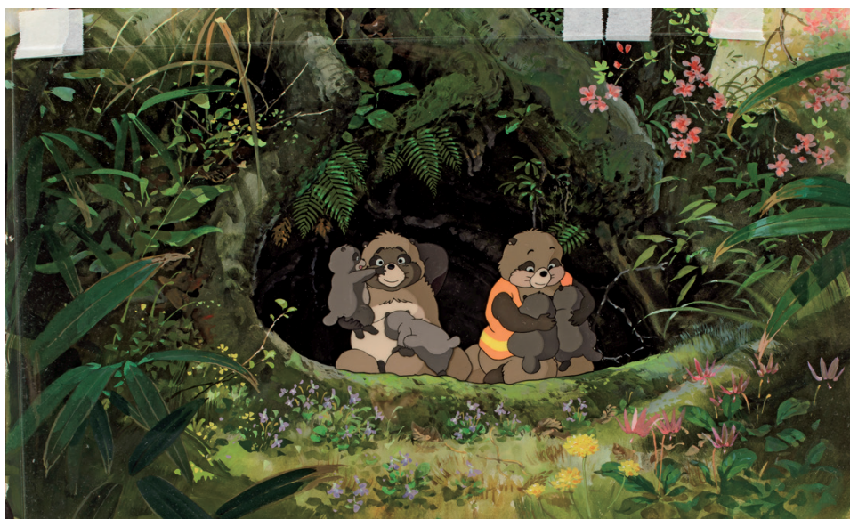
Pom Poko © 1994 Isao Takahata/Studio Ghibli, NH