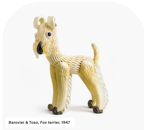
Barovier & Toso, Fox terrier , 1947