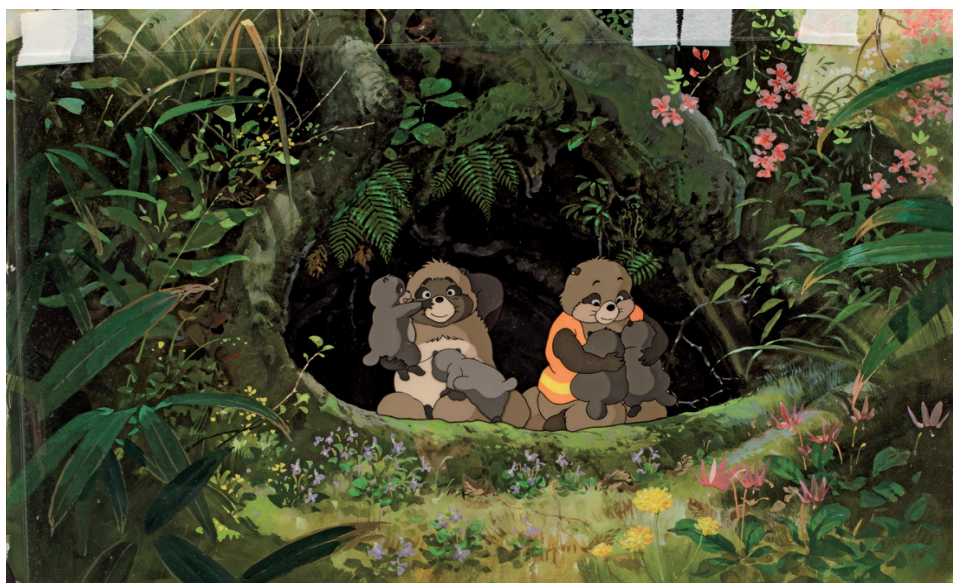
Pom Poko © 1994 Isao Takahata/Studio Ghibli, NH