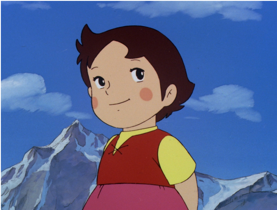
Heidi, Girl of the Alps

This part of the exhibition explores Isao Takahata's decisive relationship with the West, particularly the French-speaking world. It retraces his discovery of Prévert's poetic realism – a foundation of both his aesthetic and political engagement – and presents his in-depth research into The Shepherdess and The Chimney-Sweep (1953), through original documents that shed light on the origins of his vocation. It then examines the unprecedented challenge of adapting classic Western stories into animation (Heidi, Marco, Anne), combining ethnographic rigour with documentary ambition. Finally, it highlights Takahata's exchanges with Western artists (Grimault, Ocelot, Back, Norstein and many others), his influence on world animation and his major role in establishing animated film as a recognised art form. This journey illustrates the importance of sustained cultural exchange, portraying Takahata as a key figure in intercultural dialogue and a source of inspiration across borders.