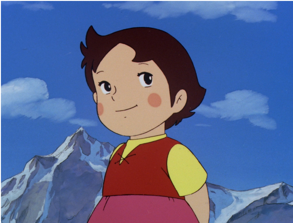
Heidi, Girl of the Alps, 1974

This part of the exhibition explores Isao Takahata's decisive relationship with the West, particularly the French-speaking world. It retraces his discovery of Prévert's poetic realism – a foundation of both his aesthetic and political engagement – and presents his in-depth research into The Shepherdess and The Chimney-Sweep (1953), through original documents that shed light on the origins of his vocation. It then examines the unprecedented challenge of adapting classic Western stories into animation (Heidi, Marco, Anne), combining ethnographic rigour with documentary ambition. Finally, it highlights Takahata's exchanges with Western artists (Grimault, Ocelot, Back, Norstein and many others), his influence on world animation and his major role in establishing animated film as a recognised art form. This journey illustrates the importance of sustained cultural exchange, portraying Takahata as a key figure in intercultural dialogue and a source of inspiration across borders.