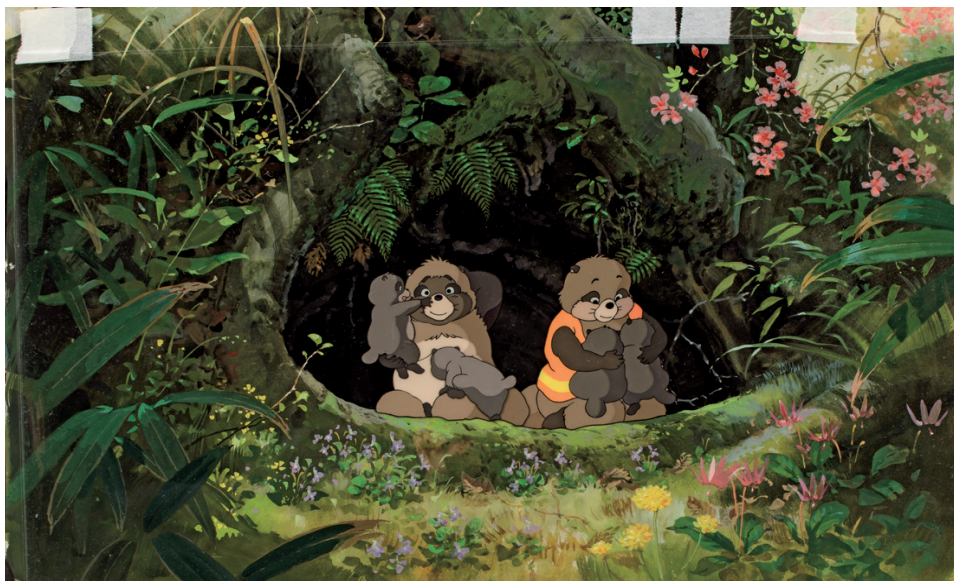
Pom Poko