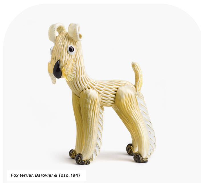
Fox terrier, Barovier & Toso, 1947