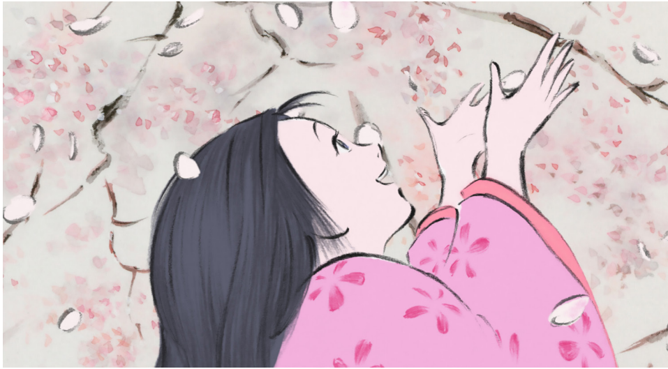
The Tale of The Princess Kaguya © 2013 Isao Takahata, Riko Sakaguchi / Studio Ghibli, NDHDMT