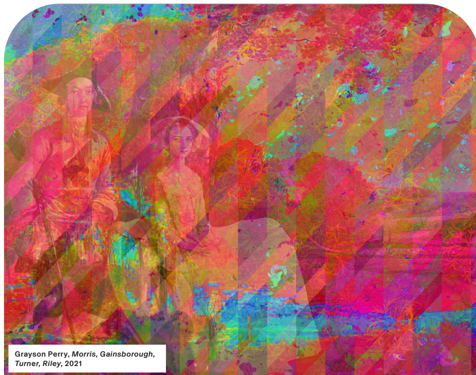
Grayson Perry, Morris, Gainsborough, Turner, Riley , 2021