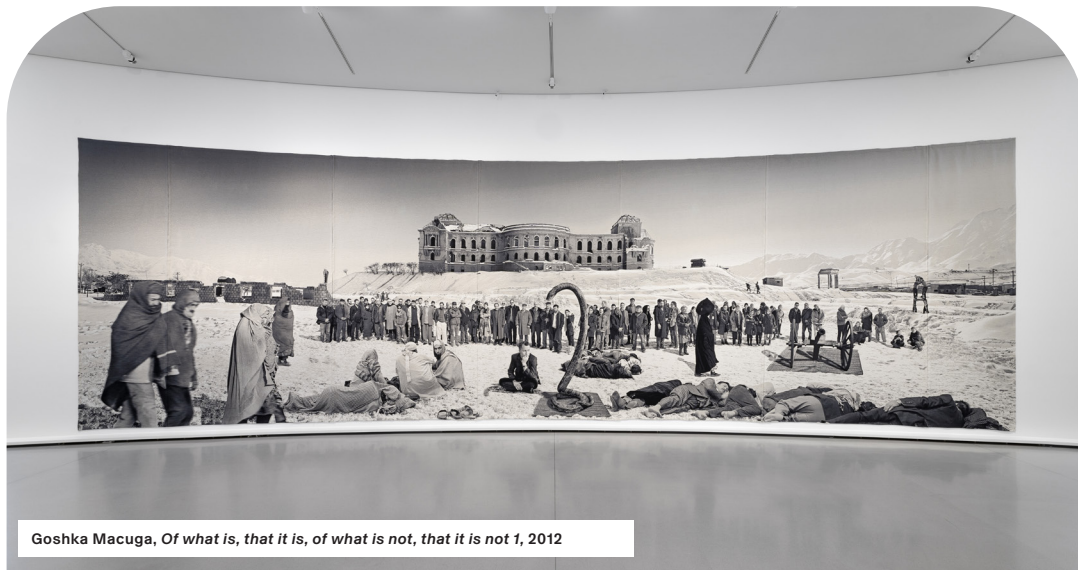
Pinault Collection.

For the last fifteen years, tapestry is enjoying a remarkable revival thanks to contemporary artists who use the medium to reflect on pressing current issues. The works of Goshka Macuga and Grayson Perry are emblematic of this renewed relevance. Their tapestry series – Of what is, that it is; of what is not, that it is not by the Polish artist and The Vanity of Small Differences by the British artist – offer sharp critiques of consumer culture, globalisation and the representations of political, societal and cultural power structures. While they draw on traditional tapestry-making techniques, the looms used are now digitally programmed and automated by skilled technicians. This fusion of craft and technology enables Macuga and Perry to create works deeply rooted in the present, proving that tapestry can be every bit as incisive and relevant as any other form of contemporary art. Alongside the works of Macuga and Perry, a selection of tapestries from Flanders, woven