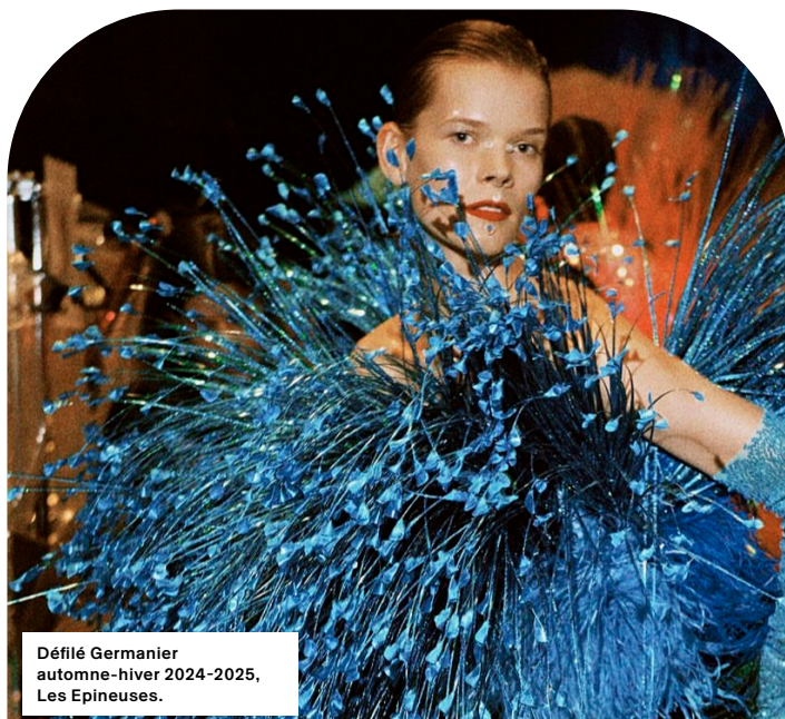
Défilé Germanier automne-hiver 2024-2025, Les Epineuses.