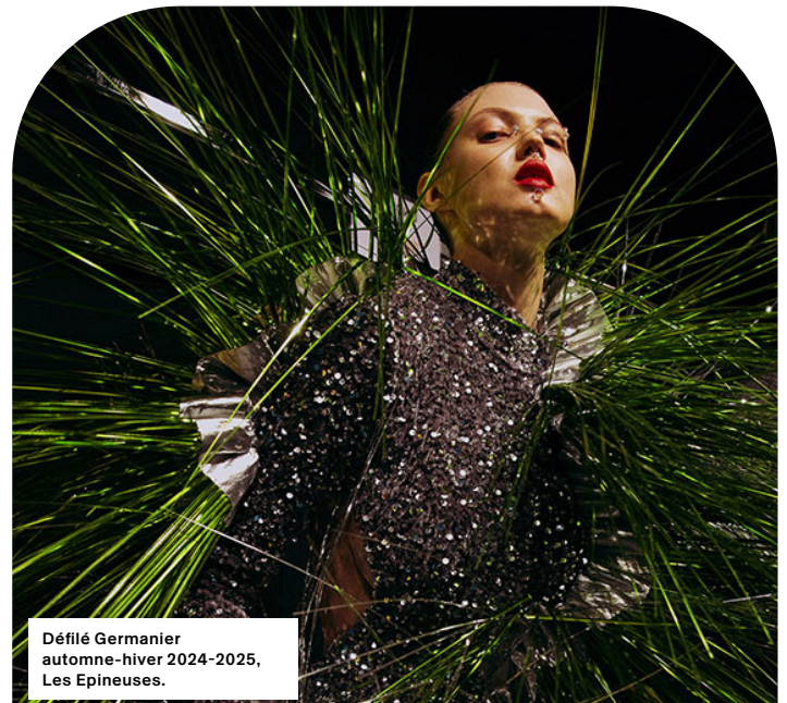
Défilé Germanier automne-hiver 2024-2025, Les Epineuses.