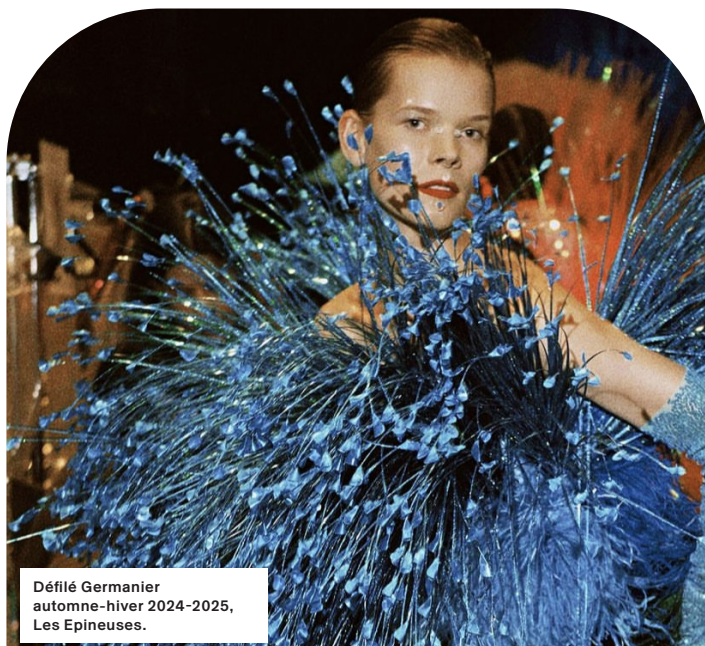
Défilé Germanier automne-hiver 2024-2025, Les Epineuses.

The immersive and educational exhibition will enable visitors to discover iconic Germanier pieces, interactive presentations on his creative process, and lectures on the future of sustainable fashion, providing an inspiring, thoughtful, and engaging experience. By paying tribute to Kévin Germanier, this carte blanche will actively contribute to a more responsible fashion industry, showcasing Swiss innovation on the international stage, while conveying a message of hope and change.