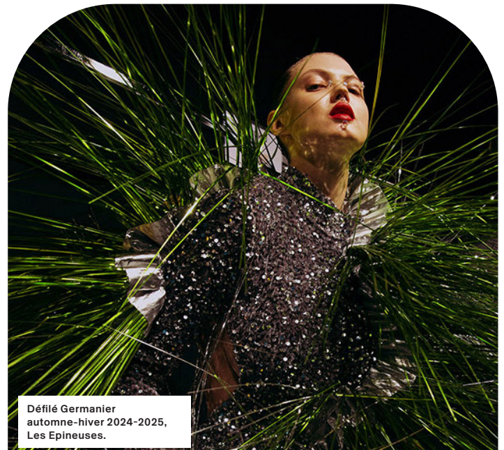
Défilé Germanier automne-hiver 2024-2025, Les Epineuses.