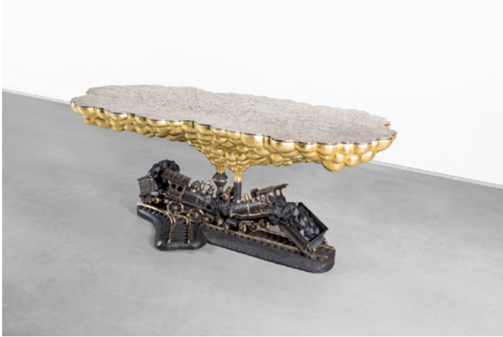
Studio Job, Train Crash Table , 2015 Polished and patinated bronze, 75 × 200 × 90 cm Paris, Carpenters Workshop Gallery