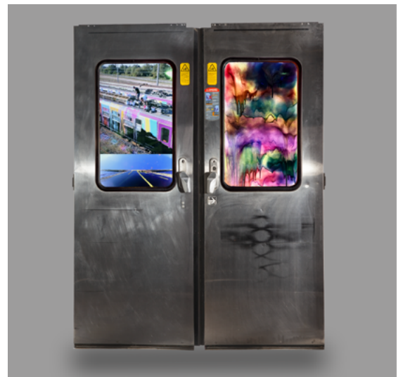
Maxime Drouet, Brume 25072021 , 2021 Car doors with video and illuminated paint, 195 × 150 × 10 cm Montreuil, Artist studio © Maxime Drouet