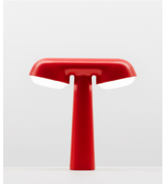
Ionna Vautrin, Lampe TGV (published jointly by Moustache and SNCF), 2017. Aluminium, polycarbonate, 27,5 × 28,5 × 9 cm.