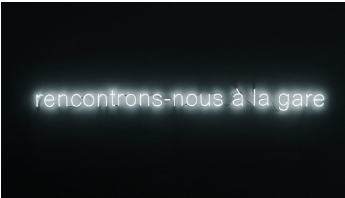
Namhee Kwon, Rencontrons-nous à la gare , 2020. White neon tubes, L 2,65 m x H lettres 11,7 cm, tube 11mm.