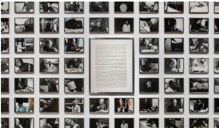
Sophie Calle, Anatoli (détail), 1984 Colour photographs, black and white photographs, text, 266 × 905 cm (18 × 23 cm each photograph) Collection FRAC Centre-Val de Loire, Orléans © Martin Argyroglo Courtesy FRAC Centre-Val de Loire © 2022, ProLitteris, Zurich