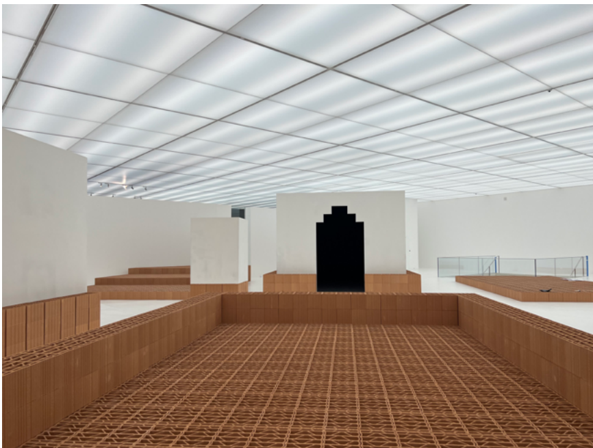
Overview of the set-up of the exhibition Rencontrons-nous à la gare..

Of the eight projects, the one by Shana Bennett and Gaïane Legendre was chosen, then reworked by Youri Kravtchenko, in order to adapt it to the needs of a museum and to the safety and conservation standards of the works presented. This scenography, imagined as a film set, immerses visitors in a hypothetical mining town reminiscent of the one in the story, thanks to the predominant use of red bricks. The staging, like the novel, helps create connections between works that are not necessarily design objects, but which promote the main theme of the mudac exhibition: the meeting.