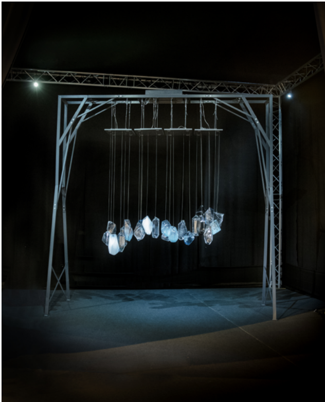
Anaïs Dunn (FR), Tension Paysage , 2021

Blown glass, infrasound system, inox, steel, 350 x 400 x 100 cm mudac collection, © François Golfier