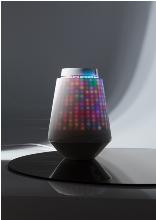
Laura Couto Rosado (CH), Veilleuse tellurique , 2015 Porcelain, gold gilding, LED, 25 cm high mudac collection

The Earth continuously emits visible and invisible messages that form the tempo of our environment. Earthquakes, geological faults and tsunamis are all observable telluric transmissions of the forces that drive it. Nevertheless, these tremors are often not perceptible. The perpetual movements of the planet transmit a pulse that emerges on its surface in the form of telluric bands.