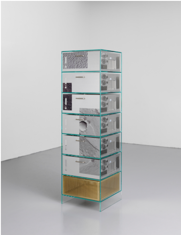
FormaFantasma (Simone Farresin & Andrea Trimarchi, IT), Cabinet 1 , 2017

Glass, digital print on aluminium, computer elements, 172 x 50 x 50 cm Edition 6 + 2 AP + 1 Prototype, Publisher Giustini/Stagetti mudac collection