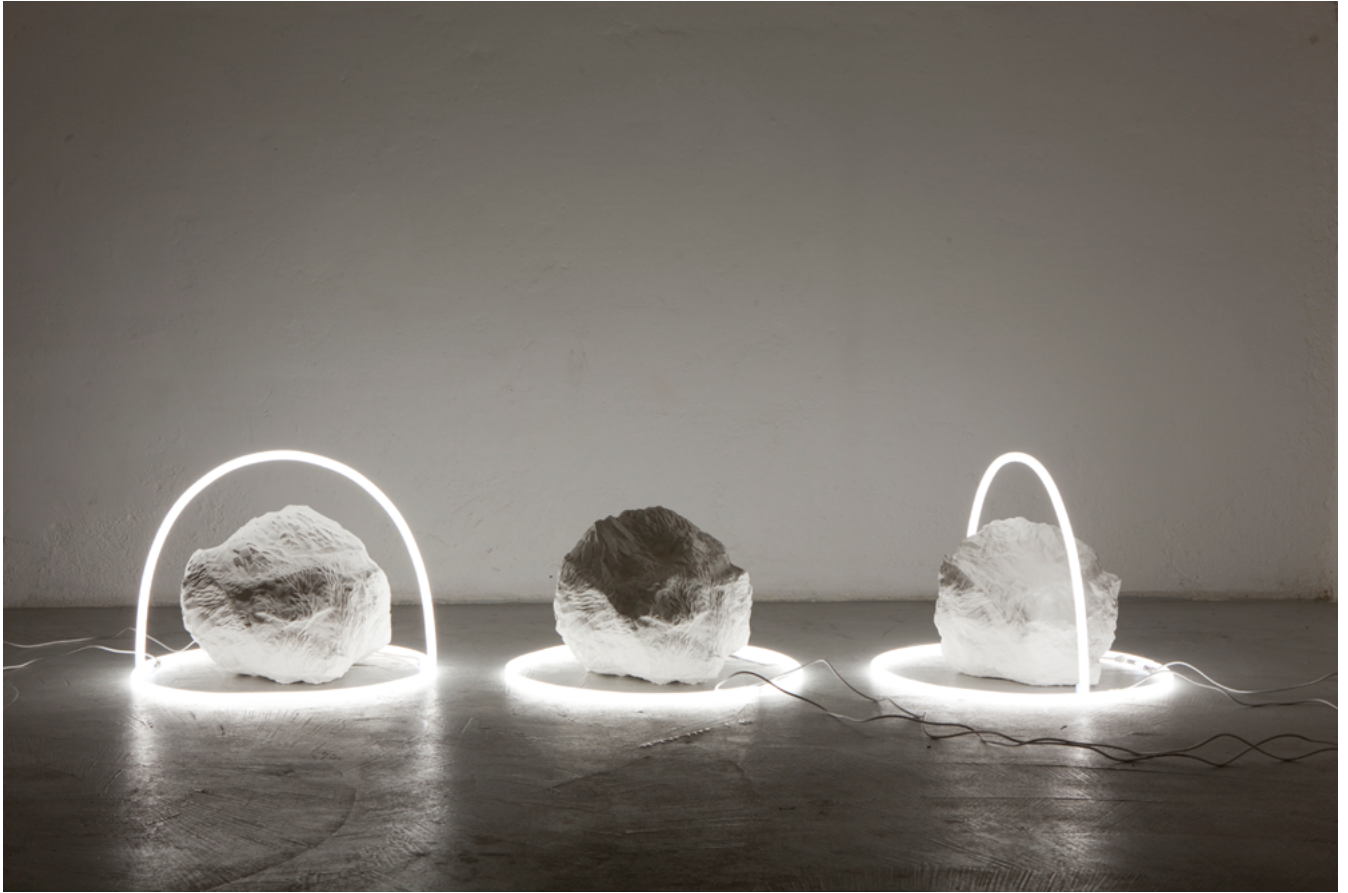
Laure Gonthier (CH), La tendresse des pierres II , Trio, 2015 Porcelain, neon light, 250 x 60 cm, unique mudac, collection of the Confederation

It is through the prism of cartography, with its measurements and boundaries, that humankind has given itself the illusion of mastering the Earth. The history of humankind has been built around the natural and artificial boundaries of its land, seeking to find itself within it and define its contours.